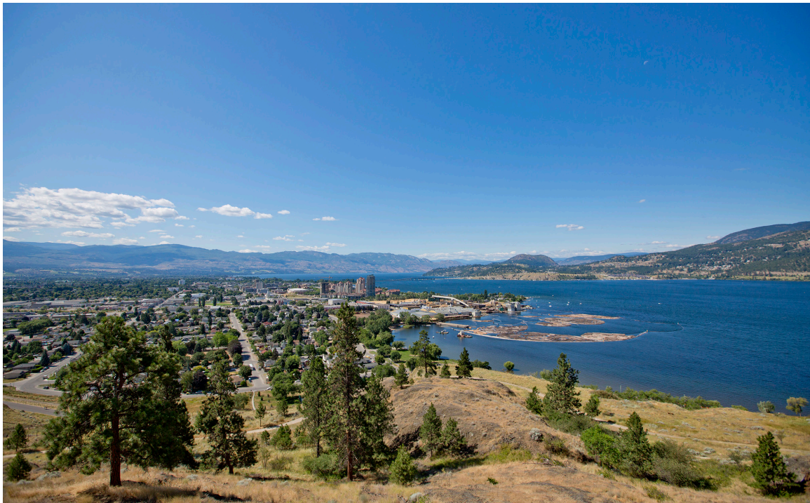
By GoToVan from Vancouver, Canada - Knox Mountain Park, CC BY 2.0, https://commons.wikimedia.org/w/index.php?curid=71070883