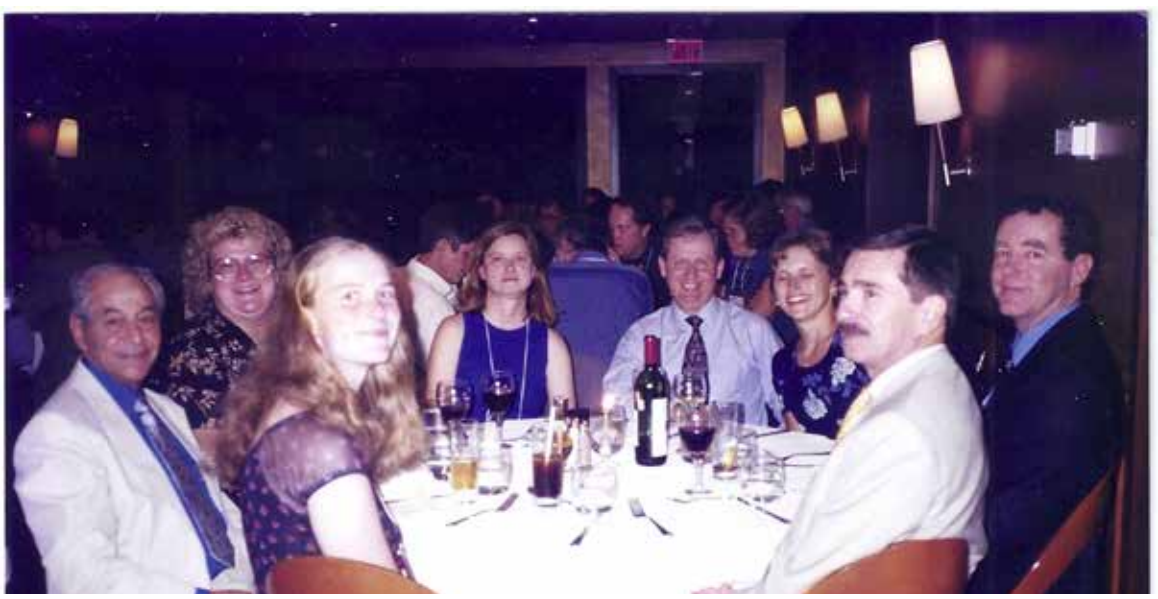
AT the awards baquet in Montreal in 1999

When asked to continue serving on the advisory board, I was happy to do so and am serving again at this time. Those who know me know that I always have at least one opinion and am not shy about stating it. I have served on scientific program committees, organizing committees, and as president. While serving as president, the PSNA celebrated its 50<sup>th</sup> anniversary, received grants from the U.S. DOE and NSF to support conference attendees (the latter were for students and pre-tenured women) for this meeting in Hawaii, and we started negotiations with El-